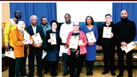
Founder members reunite 20 years on

The RRF's story began 20 years ago with the idea of creating a forum to unite the region's diverse refugee-led community organisations (RCOs) in a peer to peer network to share and compare their experiences and build a collective advocate voice for change. Our AGM in January 2020 was a great celebration, reuniting members who've played a central