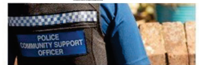
Laws and Life in the UK