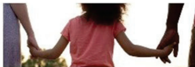
Parenting & Schools in the UK

In Albanian, Amharic, Arabic, Cantonese, English, French, Kurdish Sorani, Pashto, Spanish, Tigrinya and Urdu