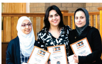
Youth Voice - all grown up

role in our journey. We were delighted and honoured to be joined by 10 founder members, 7 former Chairpersons, 19 former Trustees, and leaders of our 'Let Us Work' and 'Skilled' campaigns and Youth Voice. And we celebrated the new generation of community mobilisers now active in the RRF through our empowerment and collective voice programmes. To explore our journey over 20 years you can read our past reports at www.refugeevoices.org.uk